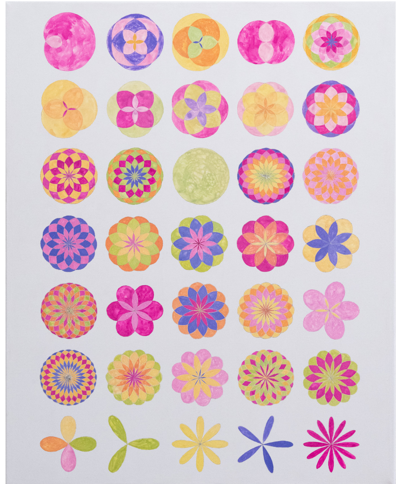
Amanda Elle Lewis Rhodonea Curve Garden (Polar Plots of Sinusoidal & Cosinusoidal Functions) , 2022 Gouache and graphite on canvas 20 x 30 in