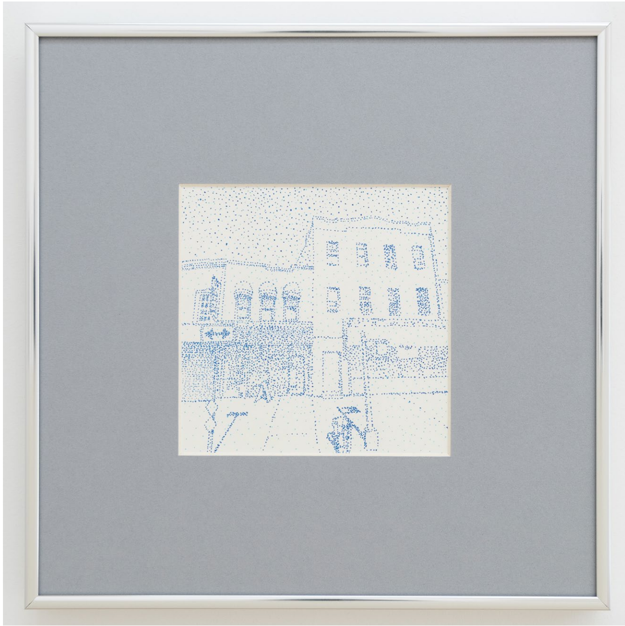
Untitled, 2023 | Pen on paper in artist frame | 5.2 in x 5.2 in (11.5 in x 11.5 in w/frame)