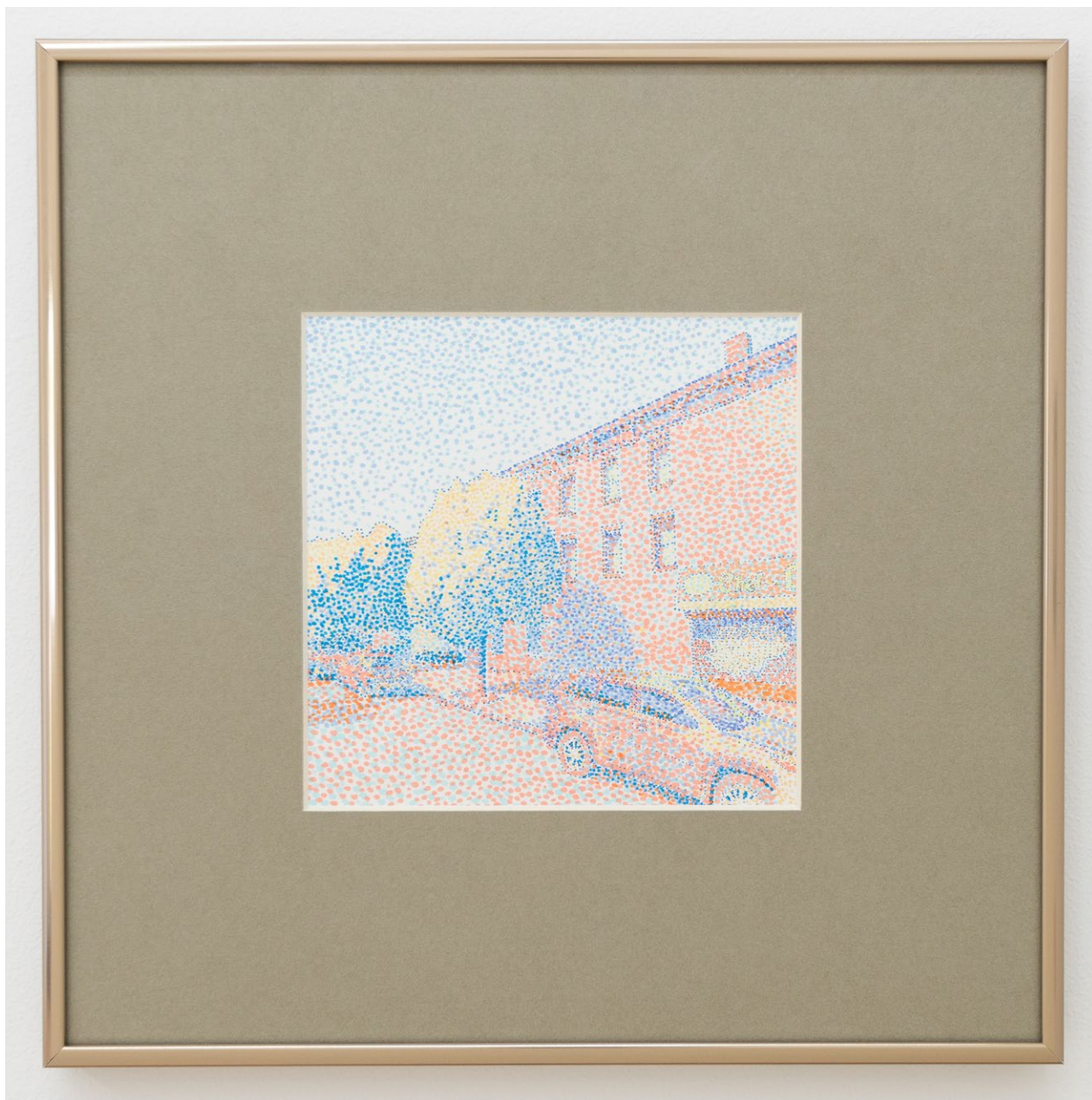
Untitled, 2023 | Marker and pen on paper in artist frame | 5.6 in x 5.6 in (12 in x 12 in w/frame)