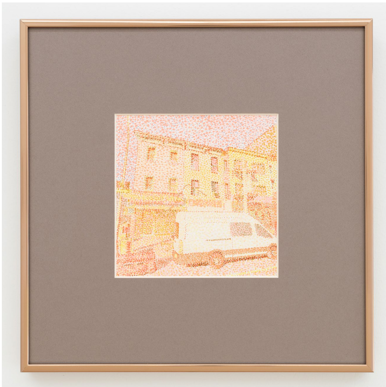
Untitled , 2023 | Marker and pen on paper in artist frame | 5.2 in x 5.2 in (11.5 in x 11.5 in w/frame)