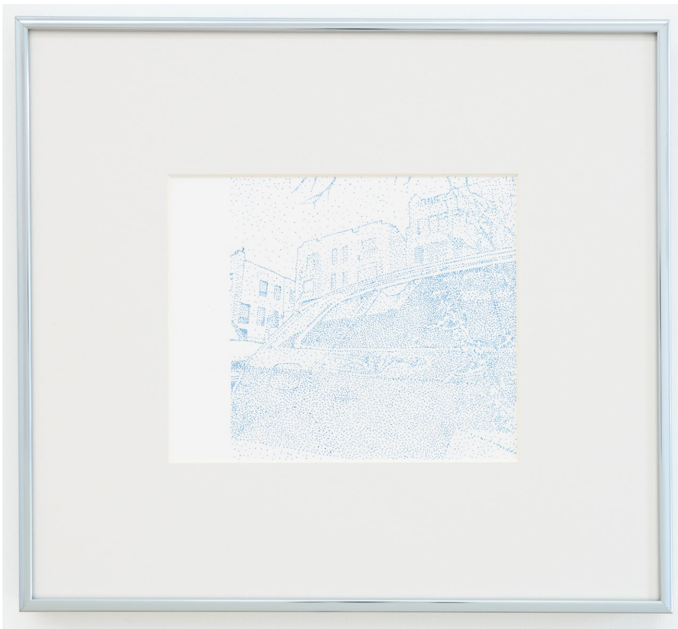
Untitled, 2023 | Pen on paper in artist frame | 5.7 in x 6.9 in (12 in x 13.25 in w/frame)