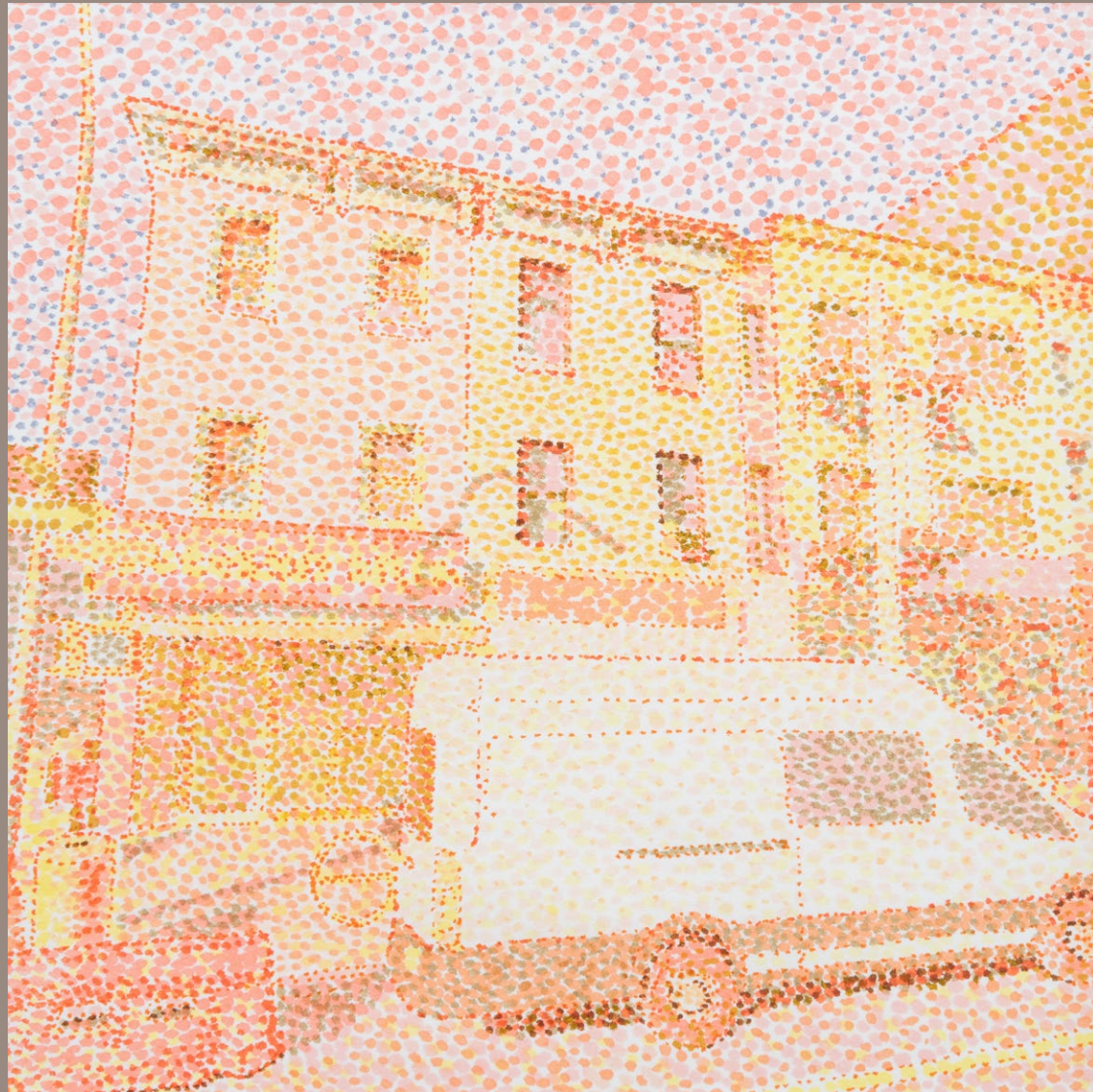
Untitled, 2023 (detail) | Marker and pen on paper in artist frame | 5.2 in x 5.2 in (11.5 in x 11.5 in w/frame)