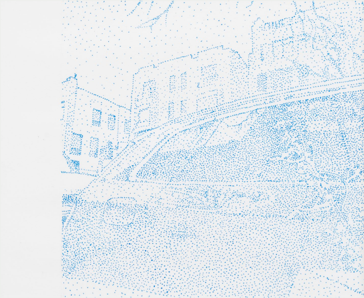
Untitled, 2023 (detail) | Pen on paper in artist frame | 5.7 in x 6.9 in (12 in x 13.25 in w/frame)