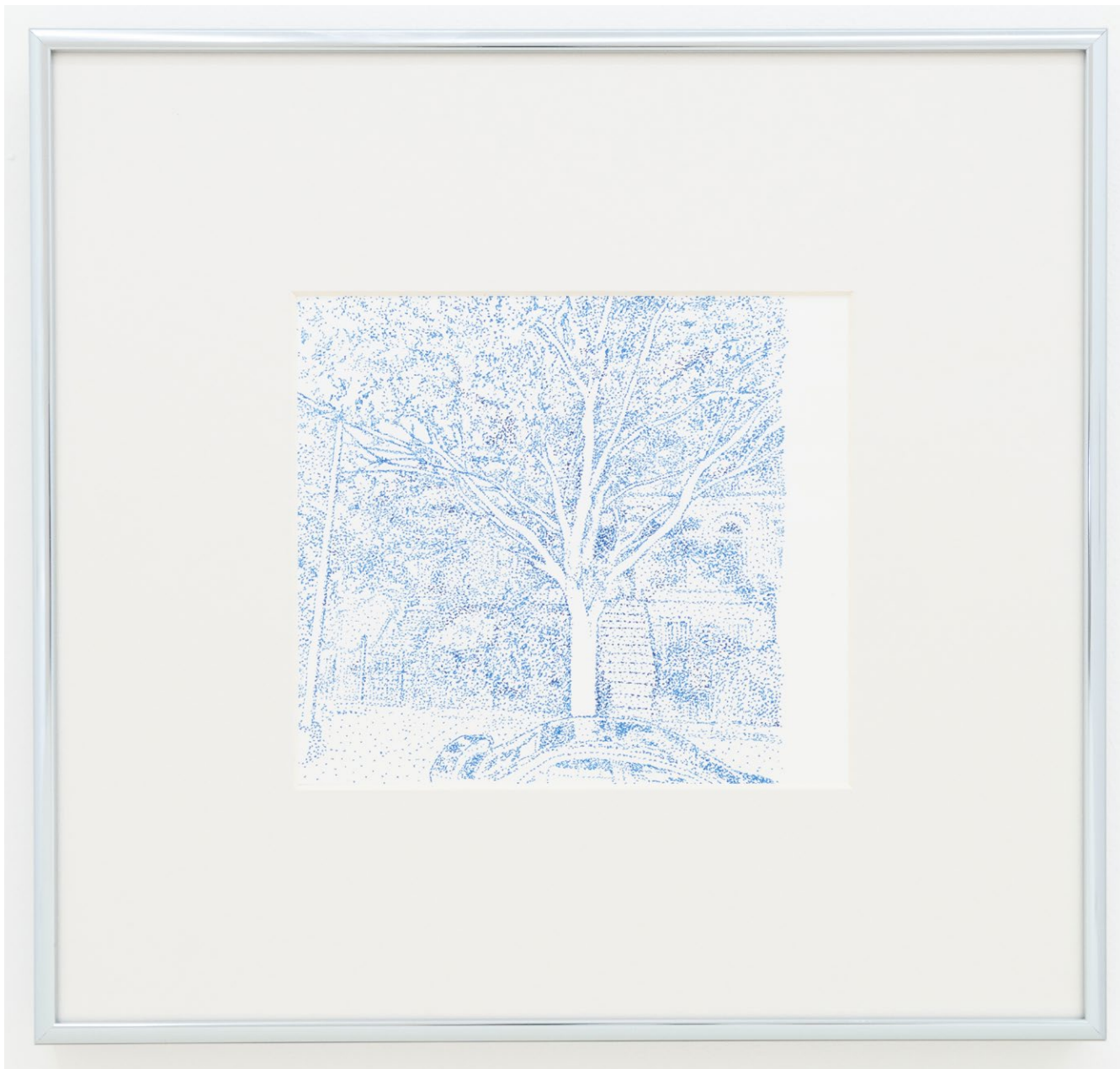
Untitled, 2023 | Pen on paper in artist frame | 5.75 in x 6.5 in (12 in x 12.9 in w/frame)