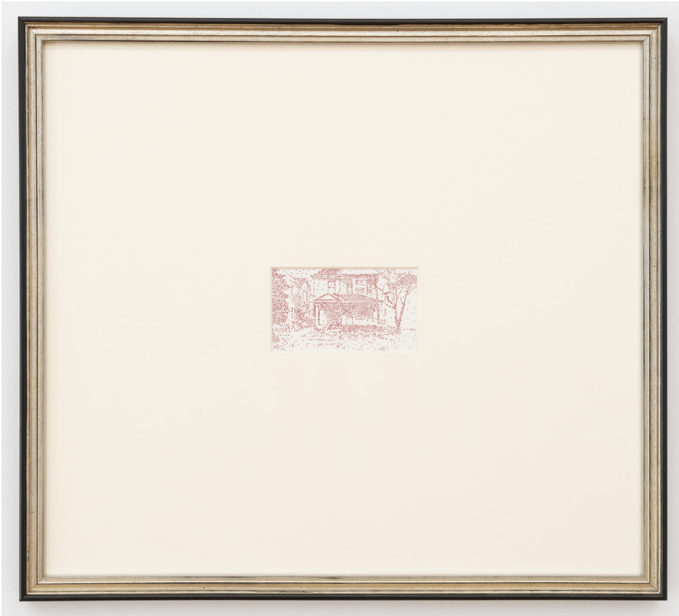
Untitled , 2023 | Pen on paper in artist frame | 2 in x 3.7 in (15 in x 16.6 w/frame)