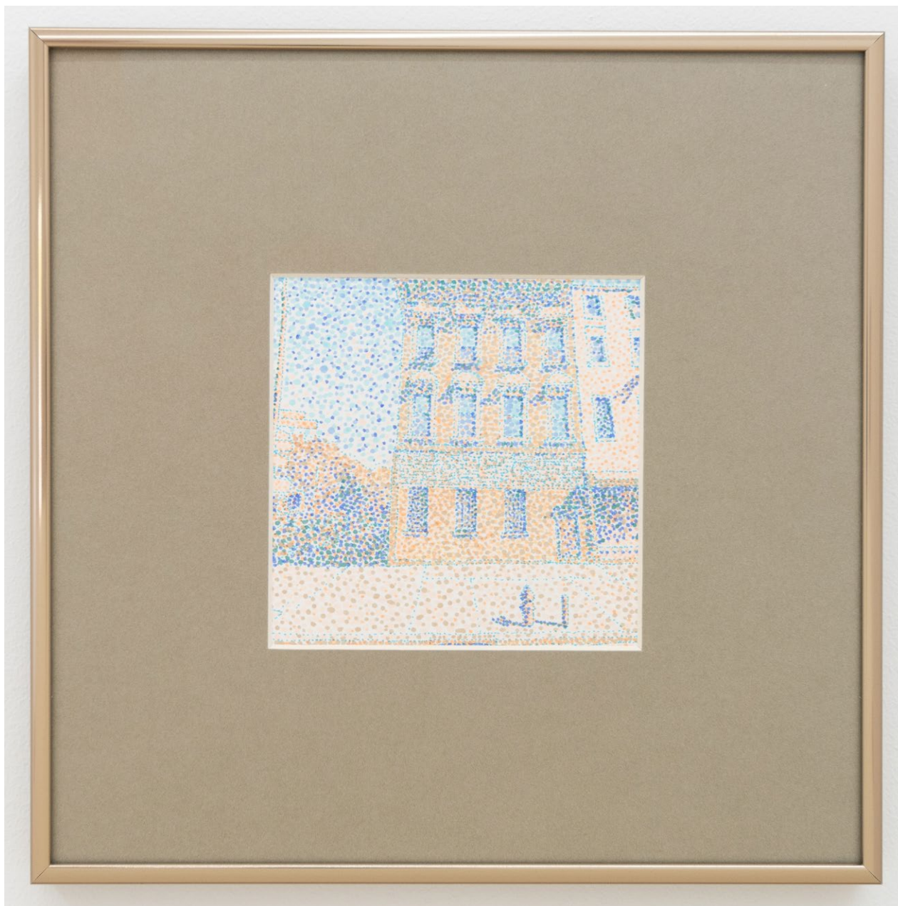
Untitled, 2023 | Marker and pen on paper in artist frame | 4.6 in x 4.6 in (11 in x 11 in w/frame)