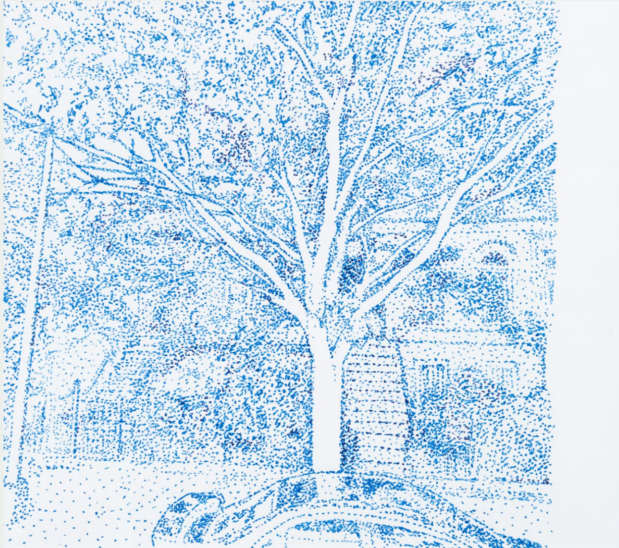
Untitled , 2023 (detail) | Pen on paper in artist frame | 5.75 in x 6.5 in (12 in x 12.9 in w/frame)