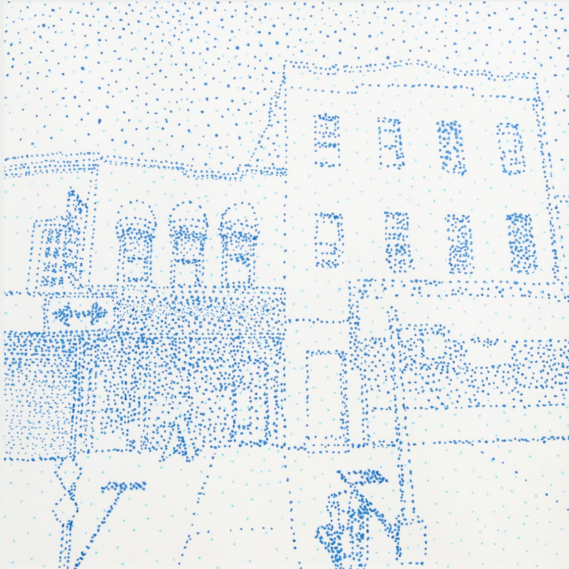
Untitled , 2023 (detail) | Pen on paper in artist frame | 5.2 in x 5.2 in (11.5 in x 11.5 in w/frame)