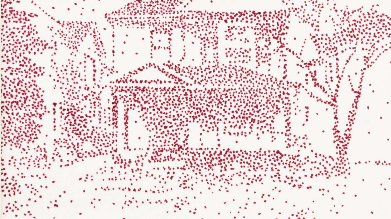
Untitled , 2023 (detail) | Pen on paper in artist frame | 2 in x 3.7 in (15 in x 16.6 w/frame)