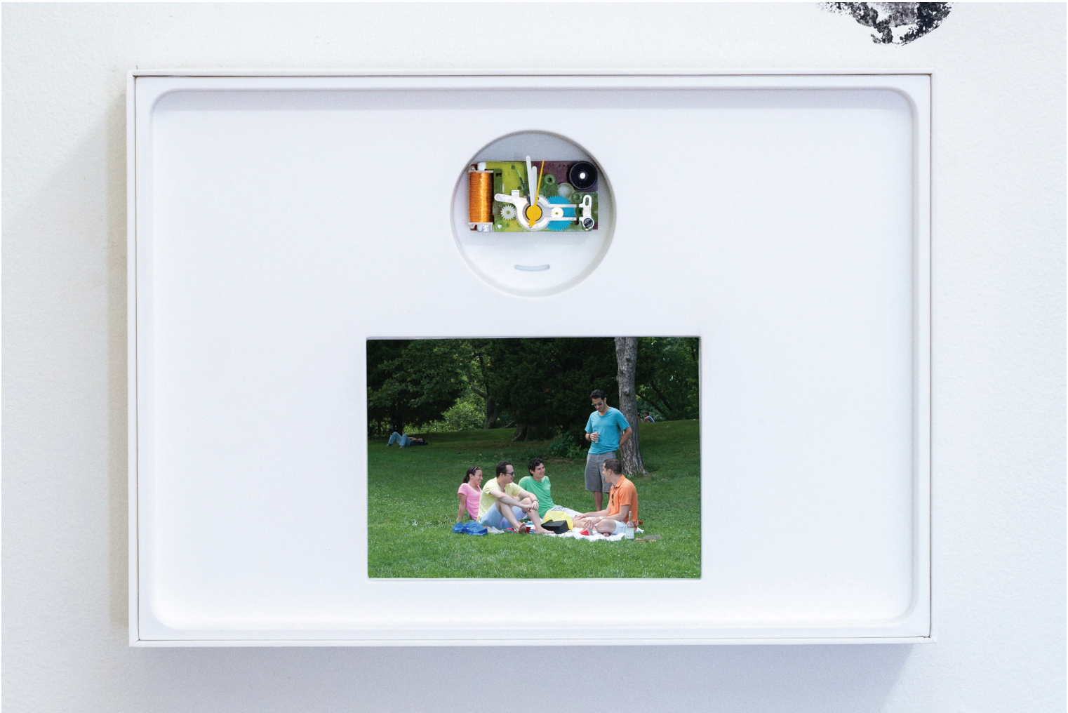
12.5" x 9" x 2.25"